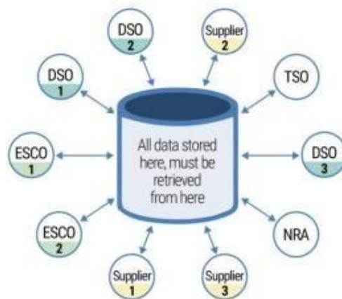
Figure 2: Schematic representation of data model in a centralised environment 6,7

In this case, Member State B has established a data hub to which data is sent and stored. All business processes run on that hub and results are sent back to its client actors. It is operated and developed by a specific party or service provider. Market participants use its functionalities. An example is the data hub established in Finland 10 , Denmark or Poland 11 . In this scenario, much data exchange is done internally within the national data hub. Hence, many of the procedural steps defined in the Annex of the Implementing Regulation (EU) 2026/855 may be considered internal within one actor, i.e., the data hub operator, and are therefore not applicable for the mapping required in the Implementing Regulation (EU) 2026/855.